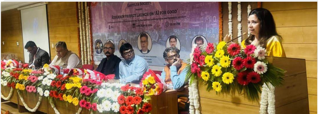
Guest lecture on Artificial Intelligence at Dr. Ram Manohar Lohiya National Law University campus, Lucknow on 19th March, 2024