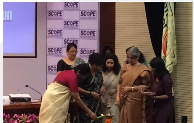
Inaugural function of Women in Law and Litigation (WILL)