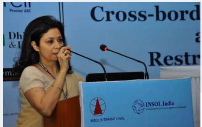
Seminar on Cross Border Insolvency and Restructuring by INSOL India, on 24th April 2016, New Delhi