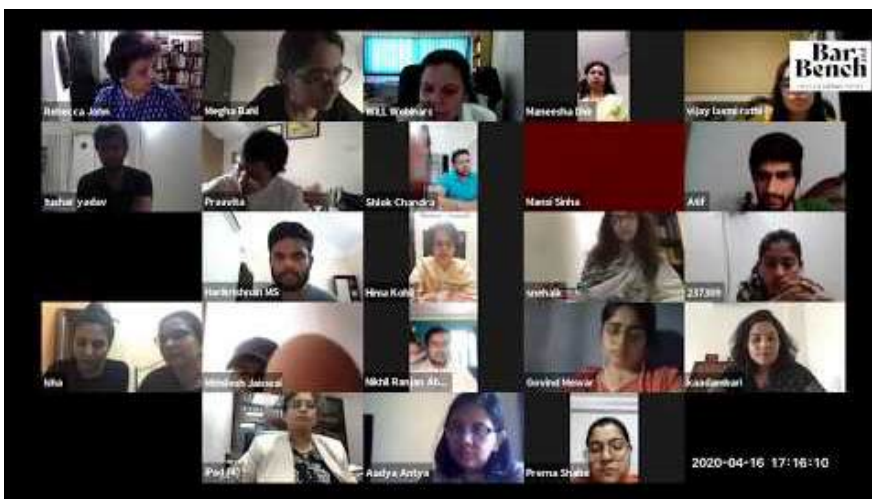
Speaking at the Webinar on The Art of Cross Examination in Criminal Trials by Women in Law and Litigation (WILL) on 16th April, 2020