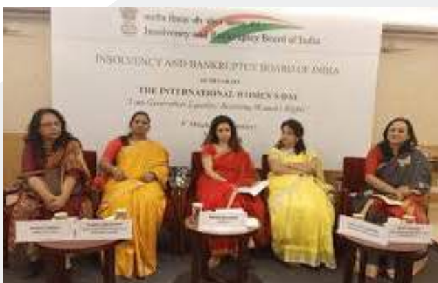
Chairing the Session at a Seminar on International Women's Day organized by Insolvency And Bankruptcy Board Of India on 8th March, 2020