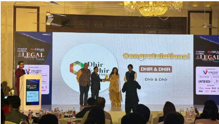
ESG law firm of the year -Legal Leader Award 2024 by BW Business world