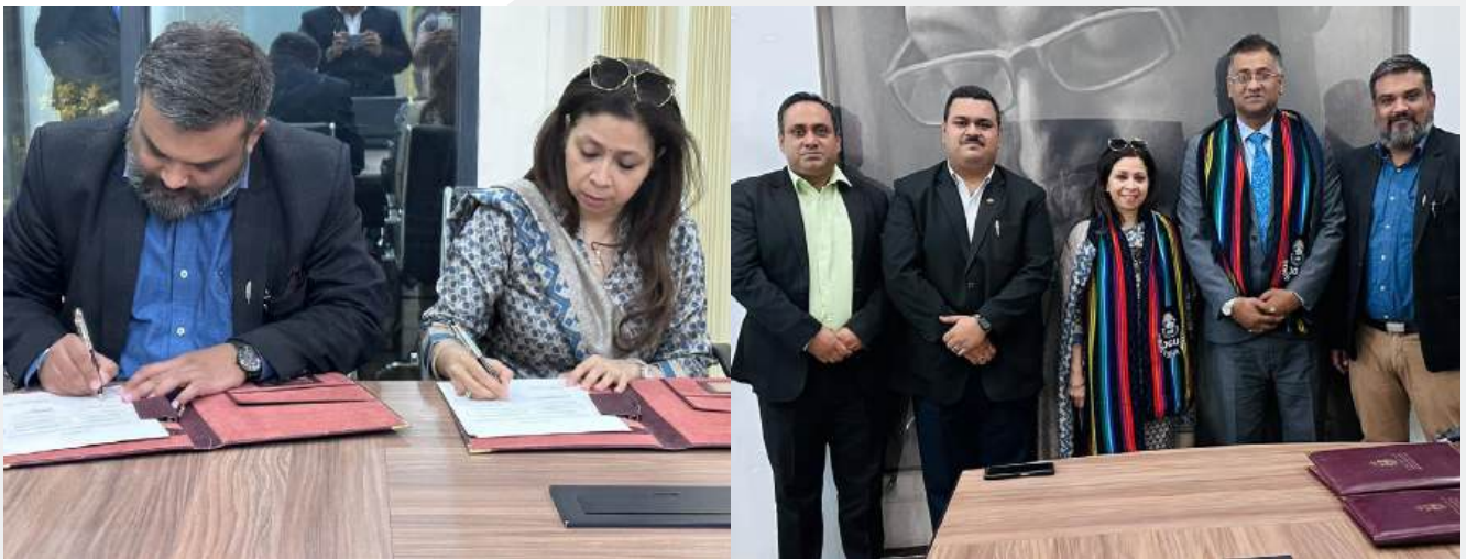
Collaboration with The Jindal Global Law school, O.P. Jindal Global University, Sonipat, Haryana for Career guidance, academic/industry sessions and internship opportunities