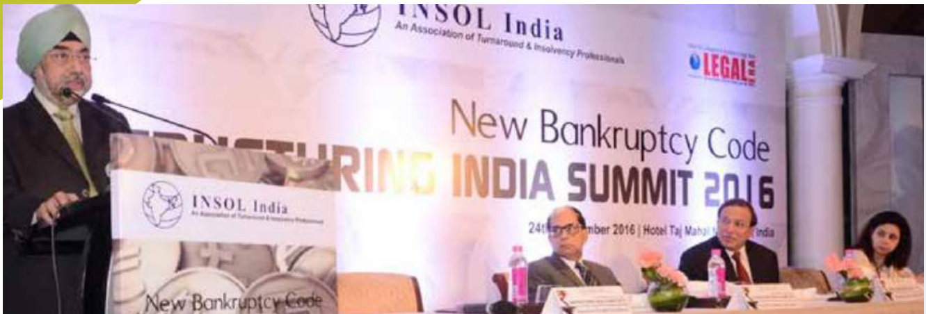
New Bankruptcy Code Restructuring India Summit, September 2016 by Legal Era and INSOL India