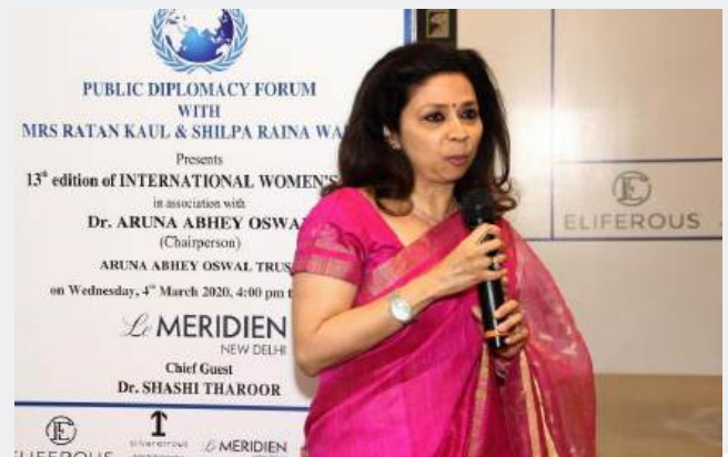
Recipient of 'Woman Lawyer of the Year 2020' Award by Public Diplomacy Forum