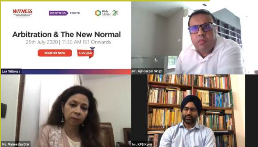
Addressing webinar on 'Arbitration and New Normal' by Lex Witness on 25th July, 2020