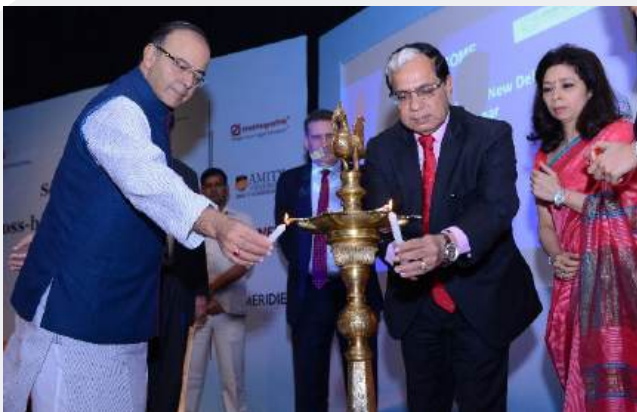
Seminar on Cross Border Insolvency and Restructuring by INSOL India, on 23rd April 2016, New Delhi