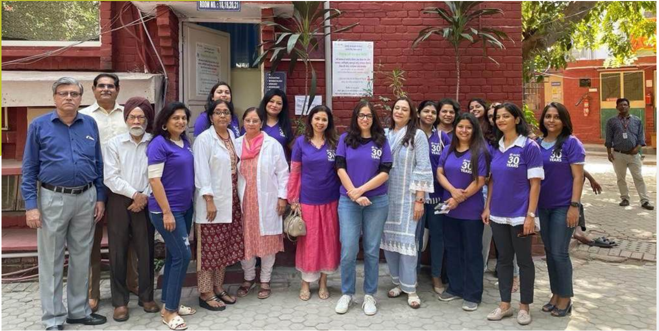
Speaking at Webinar titled INSOL Focus Webinar: Navigating cross-border insolvency recognition in Asia - Current Landscape and Future perspective organized by INSOL International