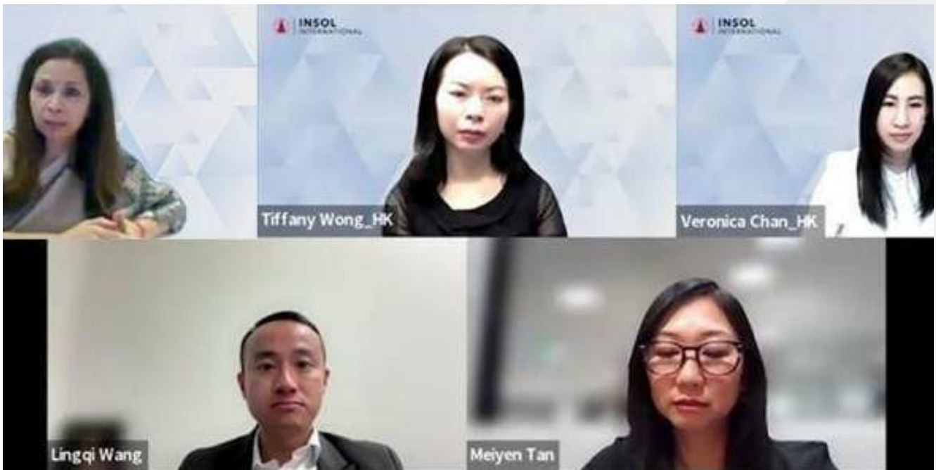
Speaking at Webinar titled INSOL Focus Webinar: Navigating cross-border insolvency recognition in Asia - Current Landscape and Future perspective organized by INSOL International