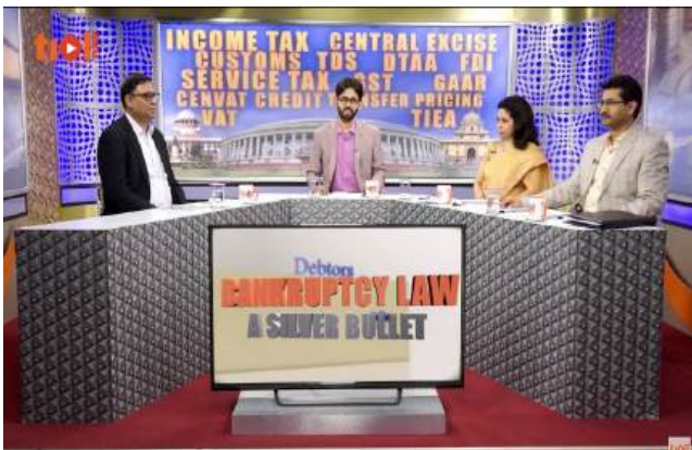
TAX India Online - Panel discussion on "Bankruptcy Code - Is it a game change?" https://www.youtube.com/watch?v=0HxuJuhk1IU