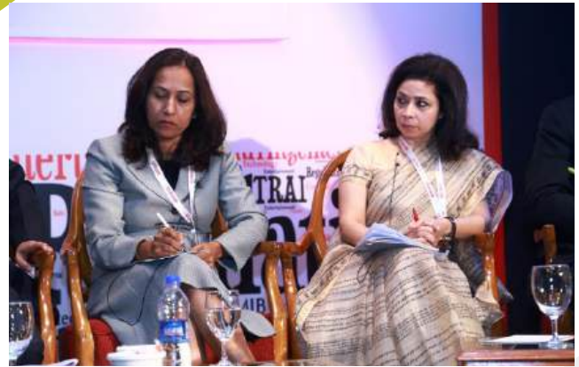
The Grand Masters 2015 (Media, Advertising & Entertainment Legal Summit) Witness - November 2015 - New Delhi