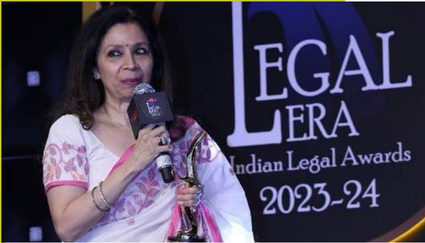
Recipient of 'Lawyer of the year - Insolvency & Restructuring' 2023-24 by Legal Era