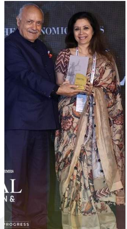
Recipient of 'Managing Partner of the Year (Female) 2023' by The Economic Times