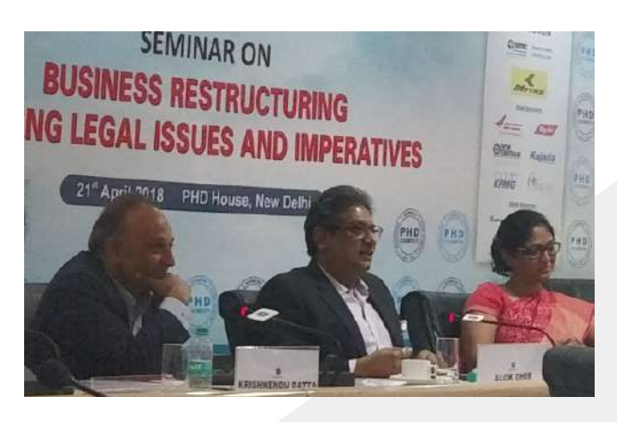
Seminar on Business Restructuring - Evolving Legal Issues and Imperatives organized by PHD Chambers of Commerce, New Delhi on 21st April, 2018