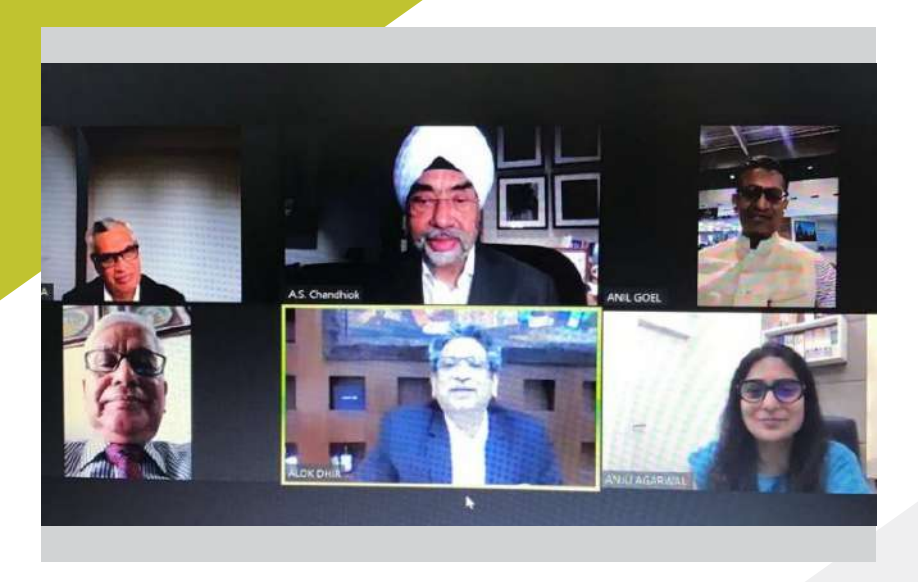
Speaking on "Liquidation in COVID - challenges" at SIG24 Samvaad Webseries V hosted by INSOL India, on Thursday, 20th August 2020