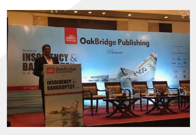
Keynote Address on The Concept of Insolvency Professionals: Advantages, Drawbacks and Solutions in a Seminar on Insolvency & Bankruptcy Code -Demystified at Shangri-La Hotels and Resorts, New Delhi on 20th April, 2018